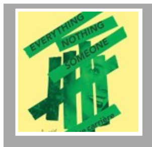
This Week's Starred Reviews